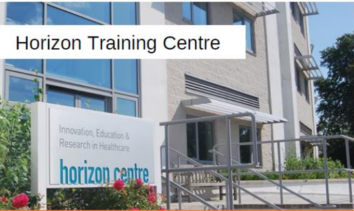
Horizon Training Centre

Torbay and South Devon NHS Foundation Trust South Devon Upper GI Unit