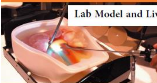
Lab Model and Live Patient Hands on Training in Theatre