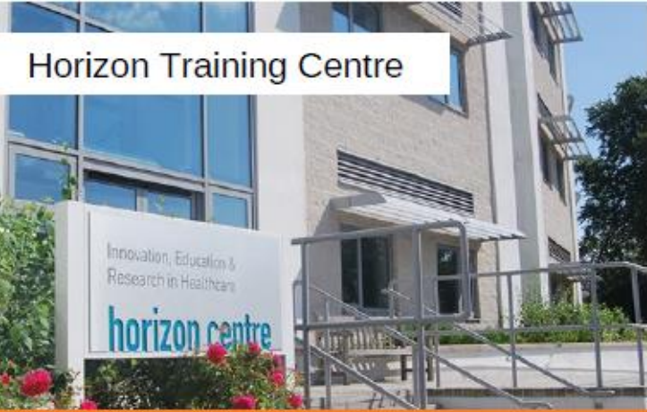
Horizon Training Centre

Torbay and South Devon NHS Foundation Trust South Devon Upper GI Unit