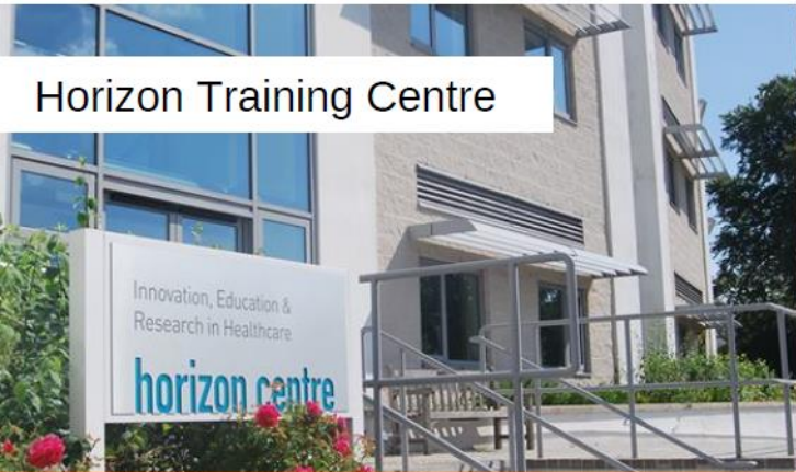
Horizon Training Centre

Torbay and South Devon NHS Foundation Trust South Devon Upper GI Unit